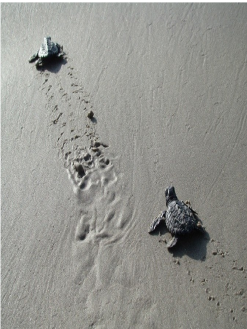
Hatchling Kemp's ridley sea turtle