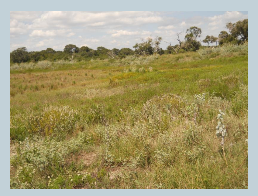
This is what the area looks like now.

This is a long term project, with a lot of different volunteer opportunities. We will be reaching out to other groups and individual members of the community to help with this project. We hope to have a social get together for all the volunteers upon completion. If you're interested in becoming involved, or would like more information, please contact us.